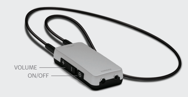
Roger MyLink telecoil neckloop

Simply turn on your Roger MyLink and use its volume controls. After syncing your Roger MyLink to the Roger Pen, you must select a telecoil setting on your remote (T or MT) to hear the audio from the Roger Pen. The Roger MyLink features a telecoil neckloop that is worn around your neck.